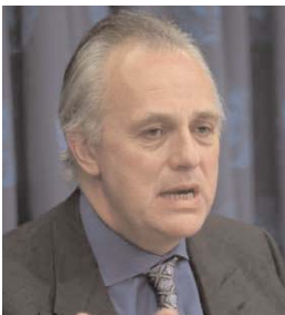
Mark Malloch-Brown Administrator, UNDP

From: “At the Heart of Everything Lies HIV/AIDS,” Statement by Stephen Lewis, UN Special Envoy for HIV/AIDS in Africa: Zambia Test Case for G8 Summit. June 11, 2004