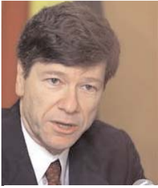
Jeffrey Sachs, Director UN Millennium Project

“International Monetary Fund program design has paid almost no systematic attention to the [Millennium Development] goals when considering a country’s budget or macroeconomic framework. In the vast number of country programs supported by the IMF since the adoption of the goals, there has been almost no discussion about whether the plans are consistent with achieving them...In its country-level advisory work, the UN Millennium Project has found that multilateral and bilateral institutions have not encouraged countries to take the Millennium Development Goals seriously as operational objectives. Many low-income countries have already designed plans to scale-up their sector strategies, but due to budget constraints could not implement them. In other cases, countries are advised to not even consider such scaled-up plans.”